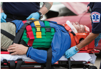
Wrap-around design for easy application and maximum support